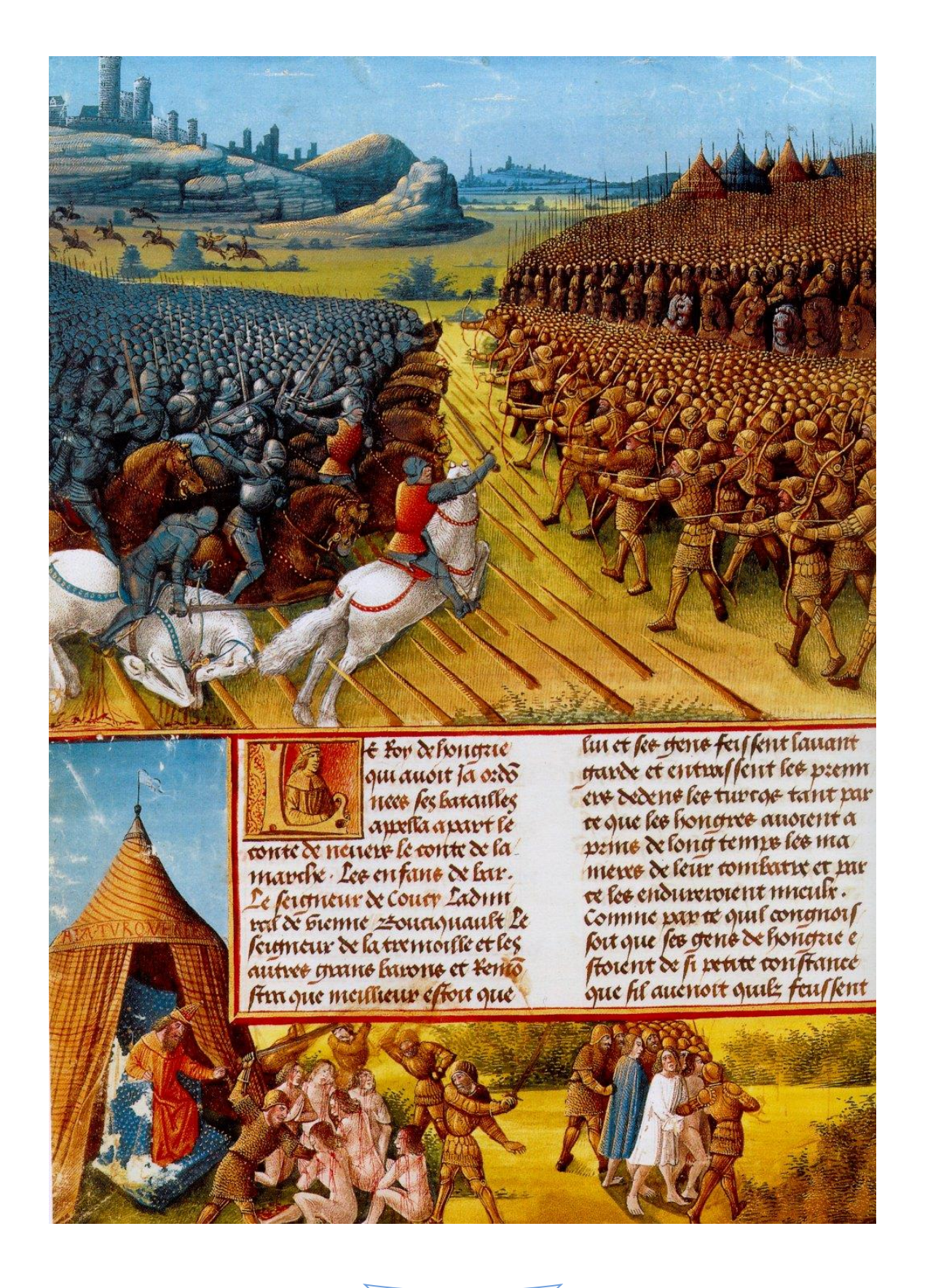
The Battle of Nicopolis between Crusaders and Turks